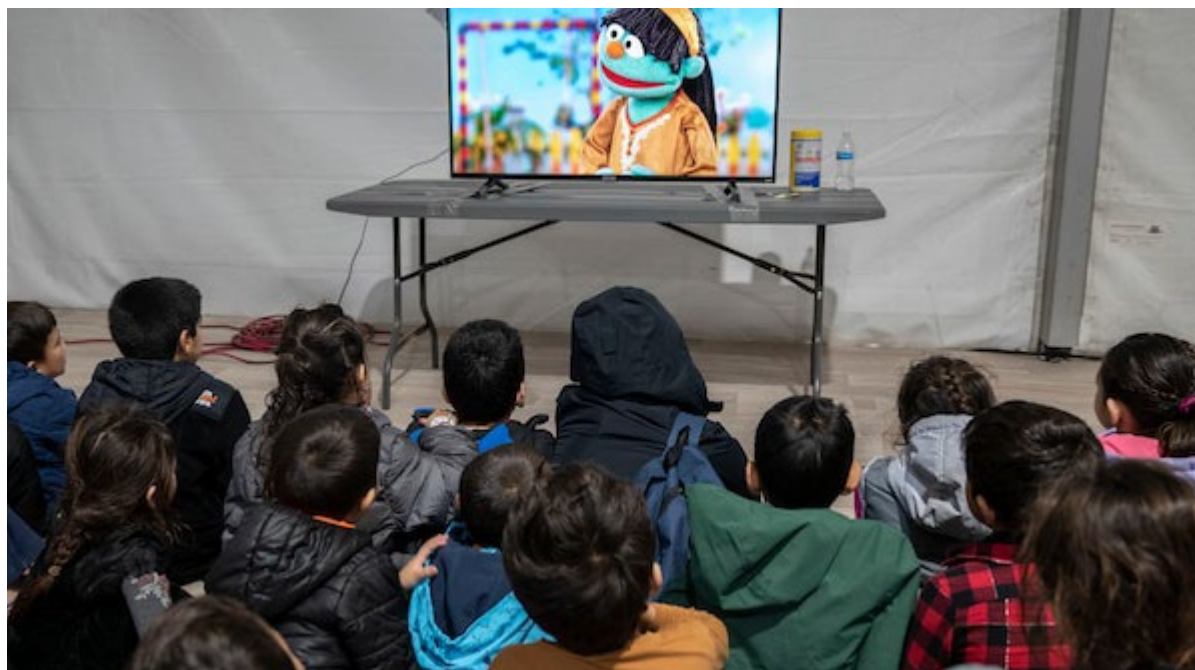
Photo credit: U.S. Air Force/Tech. Sgt. Matthew B. Fredericks. Afghan children evacuated to the United States watch Sesame Street at Joint Base McGuire-Dix-Lakehurst, New Jersey, December 2021.

Educators should remember that all people have the capacity for resilience and recovery, while also recognizing that exposure to trauma and toxic stress can have short- and long-term detrimental impacts on people’s health, development and well-being. They may notice some students displaying symptoms that are associated with trauma. This table reviews general symptoms that can occur in children of all ages: