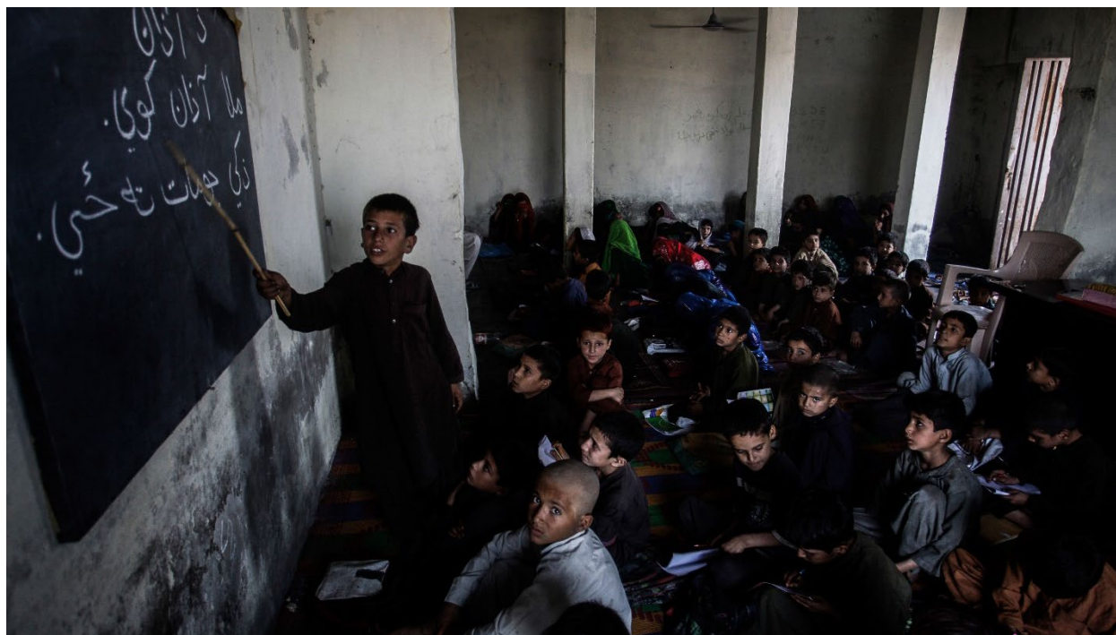
Children attend class at an Afghan refugee camp in Lahore, Pakistan, 2013

Other reasons Afghan children's education can be interrupted include poverty, building and teacher shortages, transportation and distance, and gender-related barriers. Since the Taliban takeover, more families whose children were in school are opting out of sending their children to school, with girls disproportionately impacted, especially those over primary education ages.