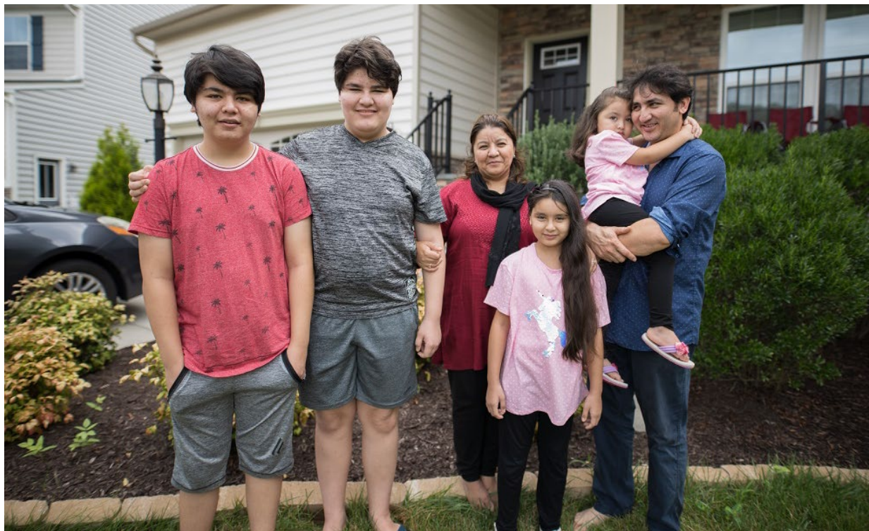
Afghan family living in Richmond, VA, six years after resettling in the U.S., September 2021.

Prior to arrival in the U.S., evacuated Afghans underwent rigorous screening and vetting by the U.S. government in Bahrain, Germany, Kuwait, Italy, Qatar, Spain, or the United Arab Emirates. Screening included a review of fingerprints, photos, and other biometric and biographic data. 4 After arriving in the U.S., evacuees were transported to military facilities for a full medical screening and a variety of services before moving on to their next destination. 5 People may have independently left the military facilities or may have been connected to a resettlement agency for some provision of initial resettlement support in their final destination.