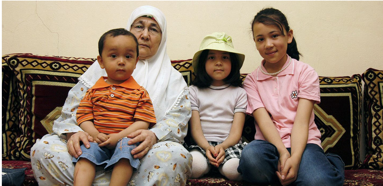
Photo credit: Yasemin Yurtman Candemir. Afghan family at home in Afghanistan, 2014.

Afghanistan closed for six months. Few students had access to remote learning, especially those in rural areas. Many suffered significant learning loss and many dropped out of school. Although schools in Afghanistan reopened after COVID-19 closures, in the period leading up to the collapse of the Afghan Government, escalating conflict in many provinces resulted in many children continuing to go without schooling.