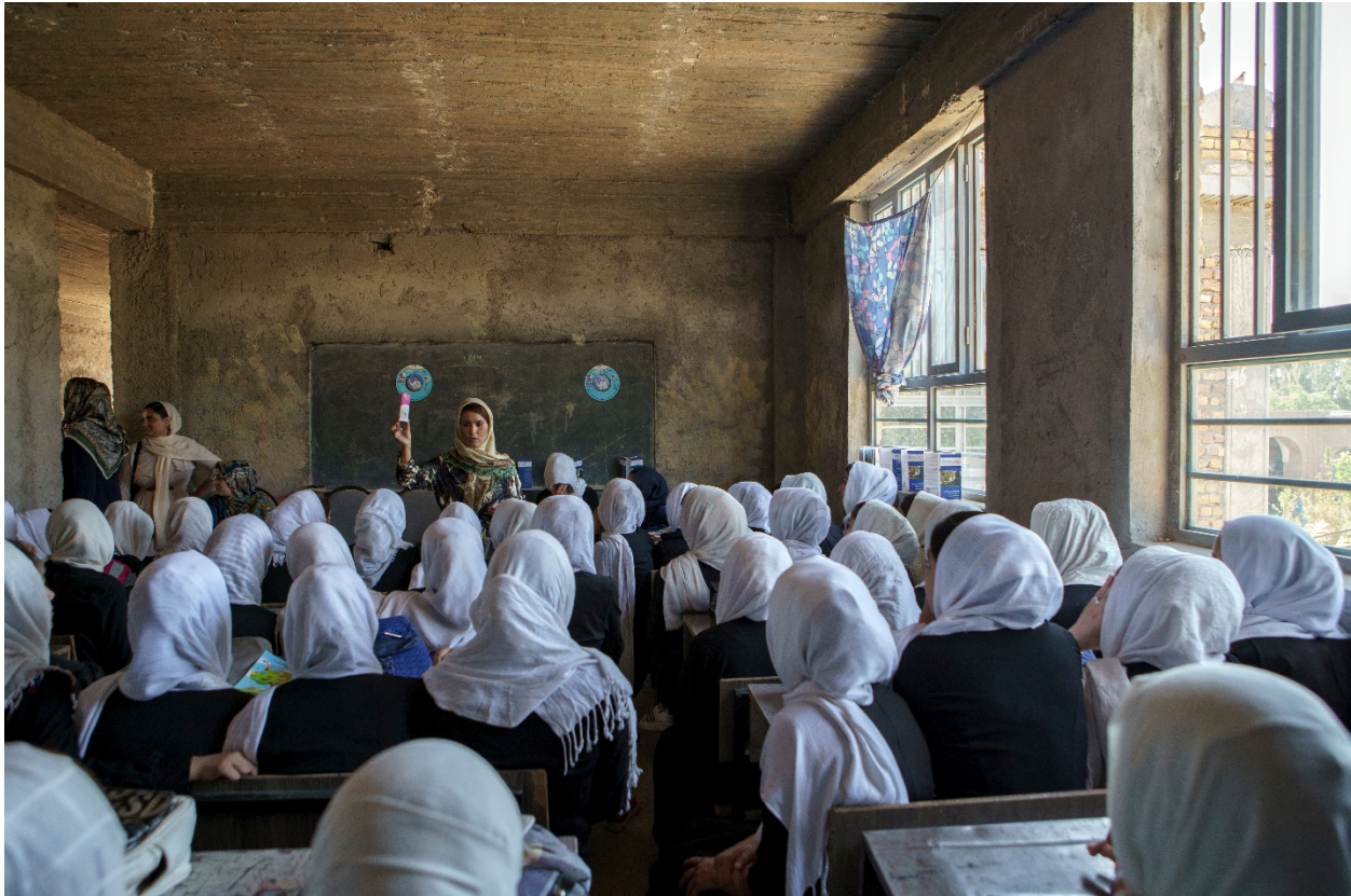
Afghan girls attend school in Herat, Afghanistan, 2019.

The elementary school day in Afghanistan is three hours and 25 minutes long. 8 The secondary school day is typically four hours long. In some cases, schools have shifts due to overcrowding or to separate girls and boys.